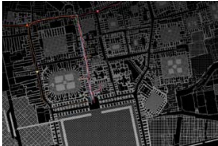
Plan no.1: routes which are followed by tourists from Gheisariye entrance

tourists who choose this entry point, enter the Bazaar after visiting the bold elements of Naghsh-e-Jahan square, and according to an interview followed by capturing the behavioral pattern, less than 30 % of tourists were aware that Imam Ali square and the Jame'e mosque are located at the end of the path, and noted the reason for choosing this route to be the attraction of bodies, sale of handicrafts, existence of coffee shops, and the possibility of finding a return route to the Naghsh-e-Jahan square. The first tourist group consider the Gheisariye façade as their location reference continue their exploration in space to the part of the Bazaar along the entrance, this group may travel the sub-rastehs between Gheisariye façade and Dar-o-Shafa bazaar but prefer to stay on the main route.