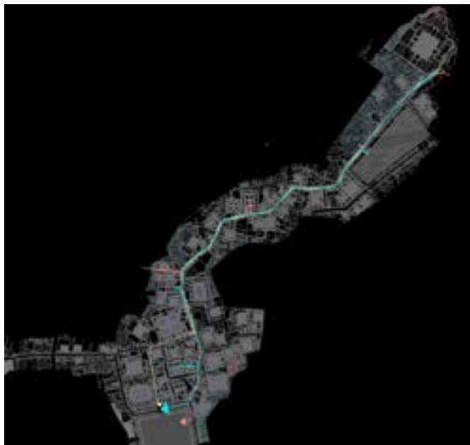
Plan no.2: routes which are followed by tourists from Enghelab entrance

Citizens and tourists have more than ever used routing applications to explore space, while tourists in some tourist destinations are facing the problem of lack of access to the Internet network and select offline maps. in this study, Google Maps, Sygic,