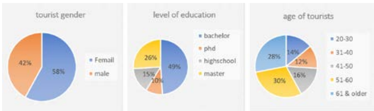
Figure no.2 : statistics of basic information of tourists

Therefore, the largest number of tourists who collaborated with the study included women aged 51 to 60, with a bachelor’s degree. The group included 12 Iranian tourists and 38 foreign tourists. The tourists’ dependency on the tour leader, the number of visits to the Bazaar on foot and the level of familiarity with Persian language was among other questions that foreign and Iranian tourists answered. According to the results of the collected data, 84 %