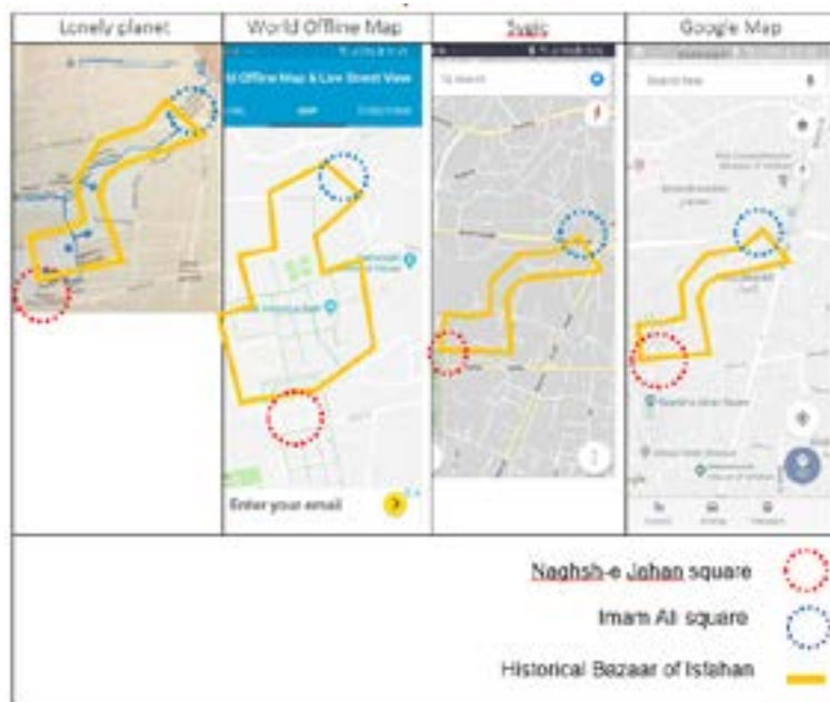
Table no.2: introducing some maps and their details which present about Historical Bazaar of Isfahan

In the following, the level of detail introduced by the