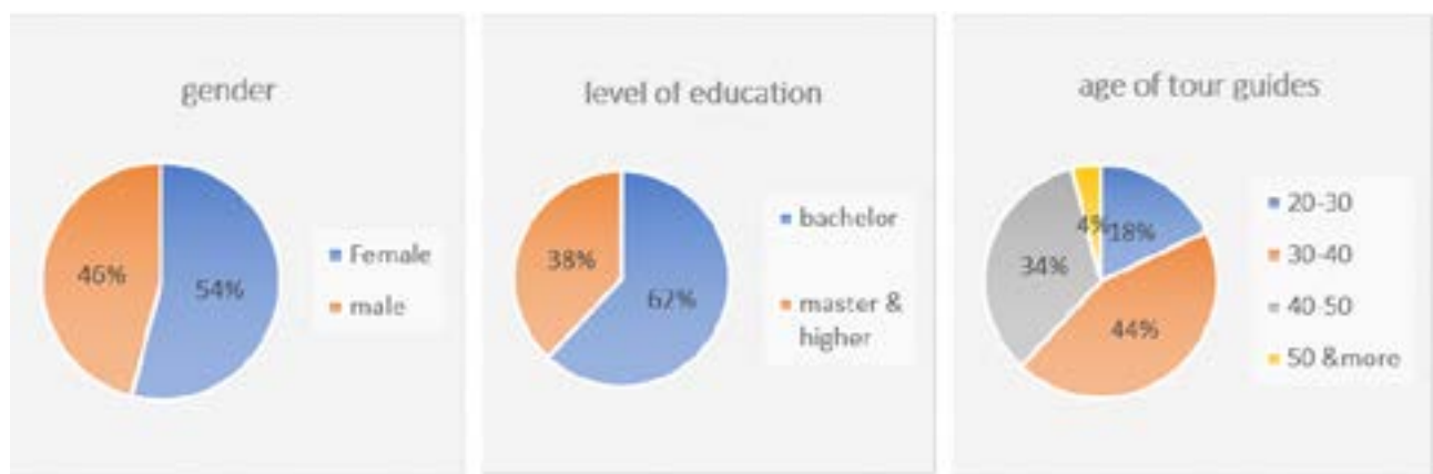
Figure no.1 : statistics of basic information of tour leader

According to the data obtained from questionnaires distributed among the tourism leaders, impact factors such as age, gender and the degree of education of this group were measured.