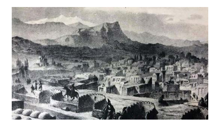
Figure 3: A view of part of Tehran and Alborz mountains The sketch of Eugene Flanding and Pascal Gost, 1840